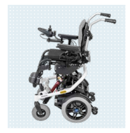
Lift seat (optional)