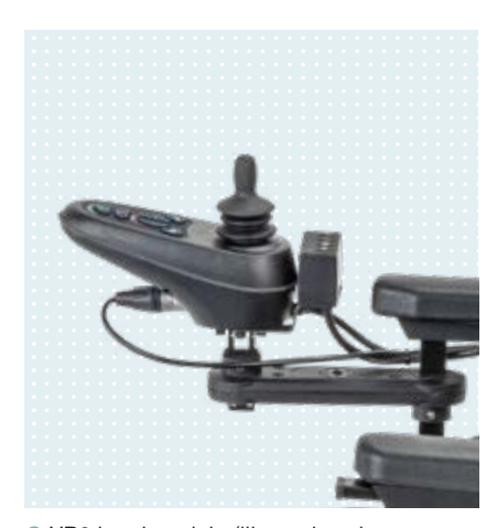
VR2 hand module (illustration shows lighting connected)