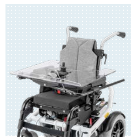
Mid-tray control in the tray (optional)