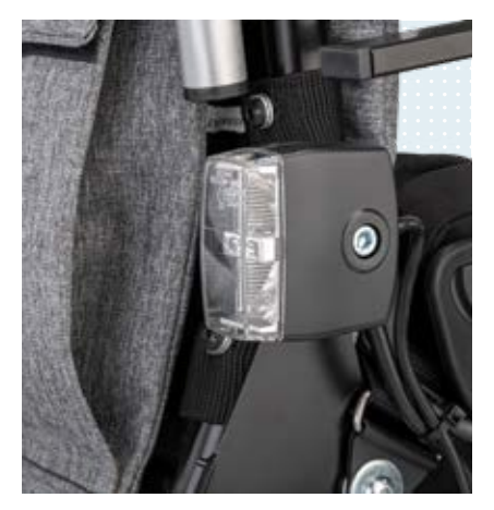
LED lighting (optional)