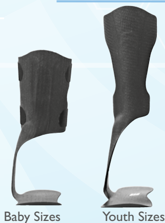
Baby Sizes Youth Sizes kiddieGAIT®